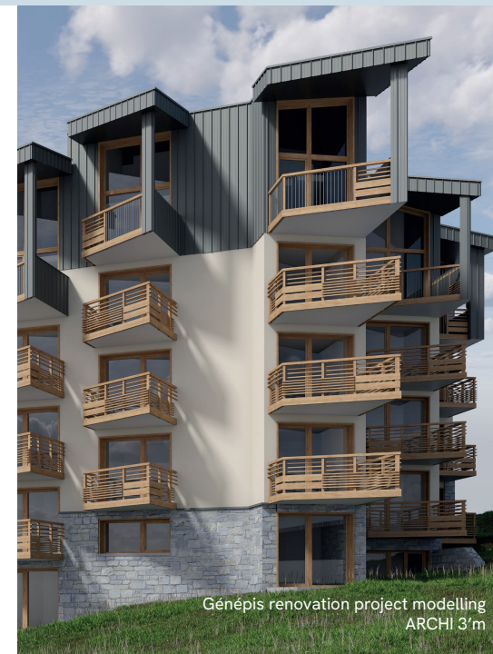
Génépis renovation project modelling ARCHI 3'm